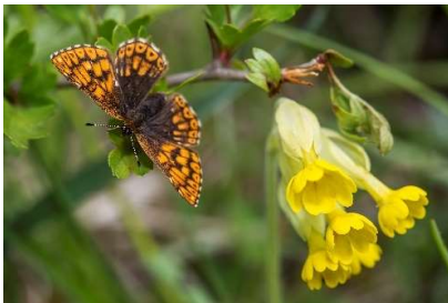
(Roy MacDonald) Is the Duke of Burgundy expanding its range?

The project will offer opportunities to explore new sites in the area and the data will be used to track trends across the landscape and inform practical woodland, grassland and farmland habitat management projects.