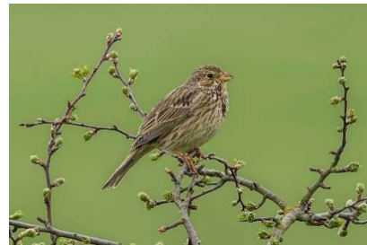
(Roy MacDonald) Where are Corn Buntings breeding?

If your interest is in birds, butterflies and/or plants we are offering exciting new opportunities to: