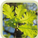
Oak leaves acorns in autumn

Get the kids involved too, help them to find some of these more common species: