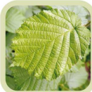
Hazel nuts in autumn