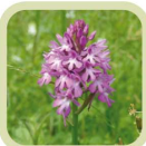
Pyramidal Orchid lucky to see

While you enjoy the wood, please don't forget to follow the Country Code: