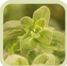
Marjoram touch and smell