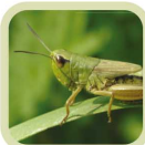
Grasshopper look down low