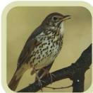
Song Thrush listen in the trees