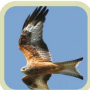
Red Kite look up high