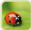
Ladybird count the spots