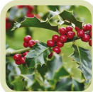
Holly berries in winter