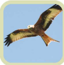
Red Kite soaring above

While you enjoy the Reserve, please don't forget to follow the Country Code: