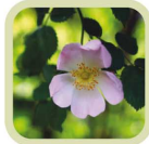
Dog Rose in the summer