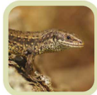
Common Lizard enjoying the sun