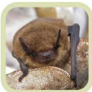
Pipistrelle Bat evening hunter