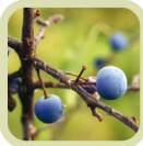
Sloes on Blackthorn