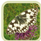
Marbled White looking for nectar

Get the kids involved too, help them to find some of these more common species: