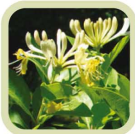
Honeysuckle a heady scent