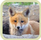
Red Fox listen and smell