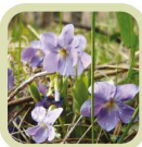
Violets early spring colour